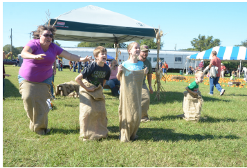
Beating Mom at the sack races during Pumpkin Patch