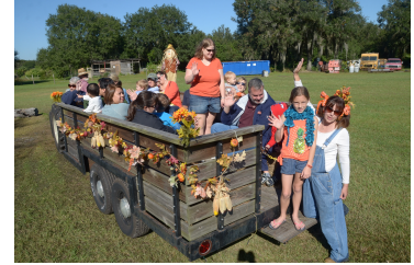
Hay ride excitement at Pumpkin Patch

Copyright © 2012 Florida Railroad Museum. All rights reserved. Contact email: membership@frm.org