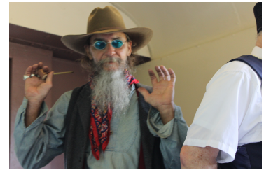
Robbing the train up with the Hole in the Head Gang