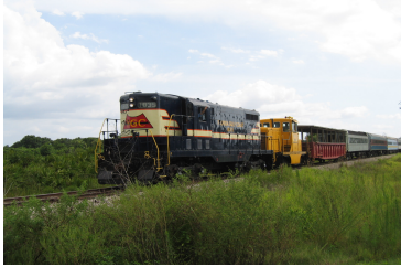
Comin round the corner!