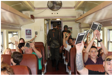
Checking papers on board the Von Kessinger's Express